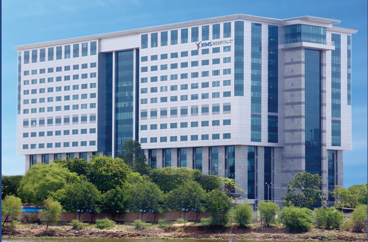
KIMS Hospitals, Gachibowli